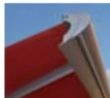
Opal Design Lux Valance Plus