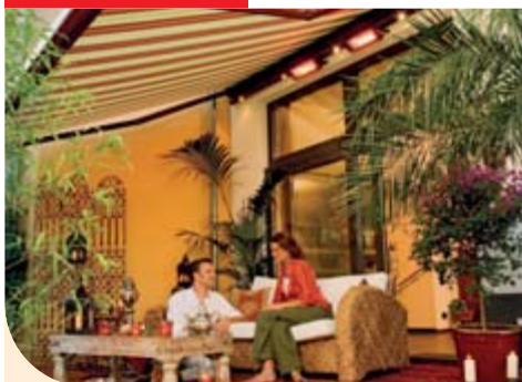
Light and warmth for your patio ...