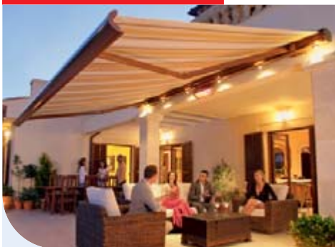
Opal Design Lux