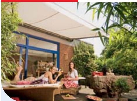
Topas with aluminium cover