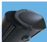
Opal Design Valance Plus