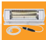
Tempura Heating System