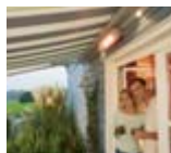
Cassita Lux with Tempura