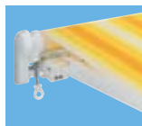
Topas without aluminium cover