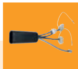
WeiTronic Combio-868 MVL