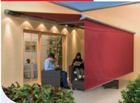
Opal Design Valance Plus