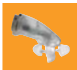
WeiTronic Aero 868 AC