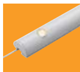
Light Bar Lux Design