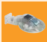
WeiTronic Sensero-868 AC 230 Plus