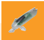
WeiTronic Aero 868 solar