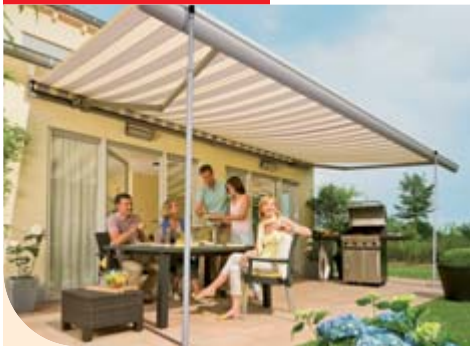
weinor wind support